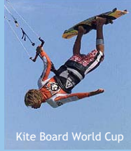
Kite Board World Cup

the Coastal Engineering Laboratory, English Prep-School, and student dorms, it offers students water sports and leisure activities especially in the summer.