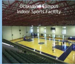
Uçaksavar Campus Indoor Sports Facility