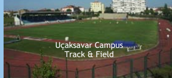
Uçaksavar Campus Track & Field