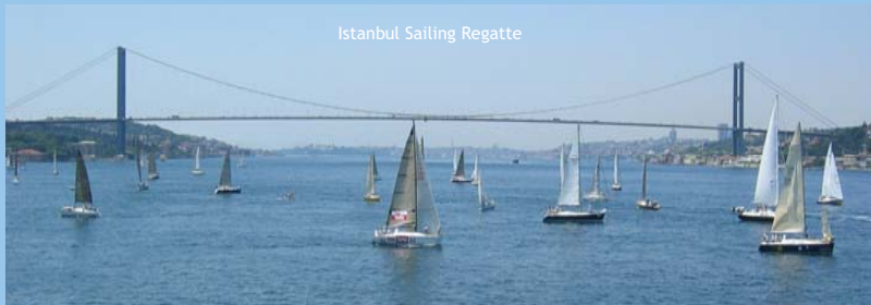
Istanbul Sailing Regatta

Surrounding the Campus, the City of Istanbul has a rich cultural and intellectual heritage. Students can enjoy studying at the cross-roads of western and eastern civilizations.