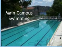
Main Campus Swimming

Uçaksavar Campus offers sports and housing facilities to graduate students at ten minutes walking distance from the Department.